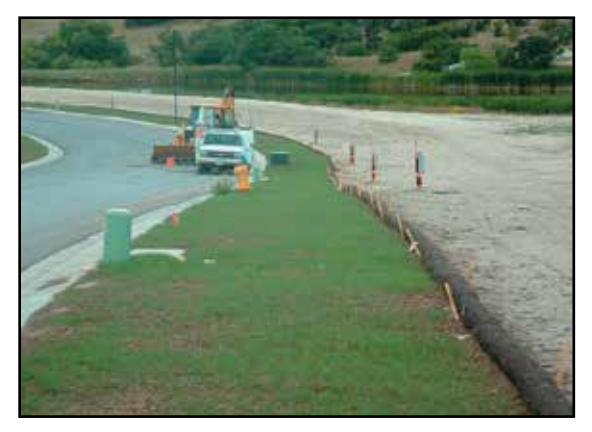
Filter Strip with a SiltSoxx<sup>™</sup>

To increase infiltration and percolation rates, deep tillage or using a Filtrexx<sup>®</sup> Engineered Soil is recommended; for more information see standard specifications and design.