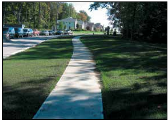
Compost Vegetated Filter Strip Along Raodside