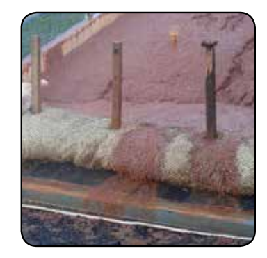
Fig. 6: 20" Straw Wattle (70% Removal Efficiency)