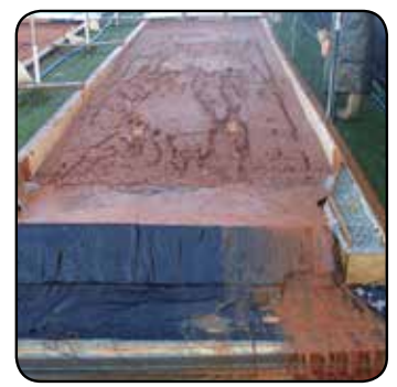
Fig. 5: 10" Triangular Silt Dike (93% Removal Efficiency)