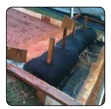
Fig. 2: 12" SiltSoxx™ (97% Removal Efficiency)