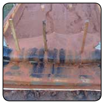
Fig. 3: 12" Off-Spec Compost Sock (66% Removal Efficiency)