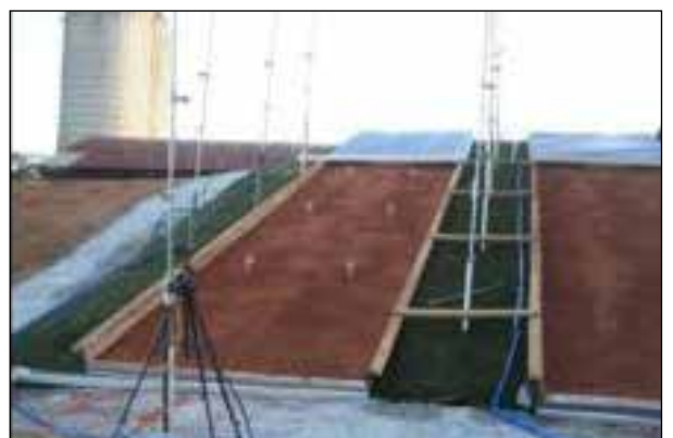
Fig. 1: Test Plot Set-Up Prior to Treatment Installation.

Immediately prior to testing, rain gauges were placed at the quarter points (i.e. 6.75, 13.5, 20.25-ft) on the slope. The slope was then exposed to sequential 20-minute rainfalls having target intensities of 2, 4, and 6 inches per hour. All runoff was collected during the testing. Additionally, periodic sediment concentration grab samples were taken and runoff rate measurements were