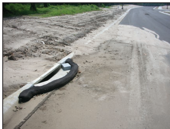
Drain Inlet Protection

For most standard curb inlet protection applications, an 8 in (200mm) diameter Inlet protection is recommended; for drainage inlets