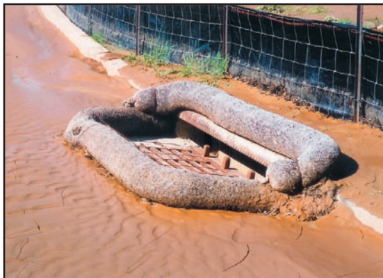
Curb Inlet Protection – Fine Silts Filtration

Curb sediment containment systems are used to reduce the sediment and pollutant load flowing to